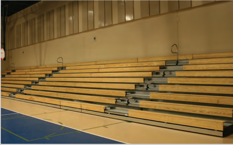
Example of Portable Bleachers

With these upgrades, the Merlis Belsher Heritage Centre will continue to play a key role in the life of the College. It will be a multi-purpose venue used by all students, staff and faculty, as well as the wider community.