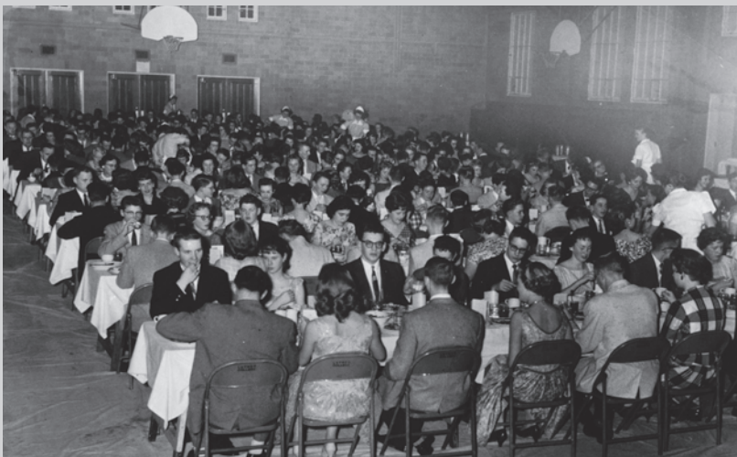
All College Banquet

Amid all the excitement about the new gym, many people have asked "What's happening to the old gym?"